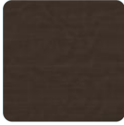
Wenge oak look