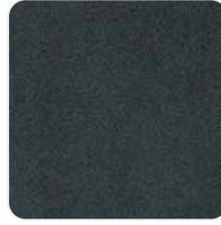
Black caviar look